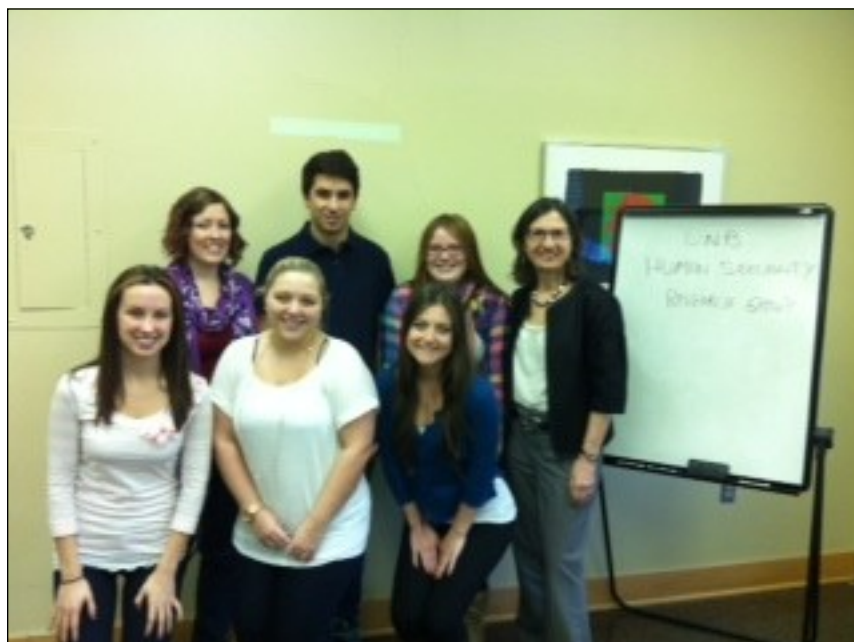
The Human Sexuality Research Group.

"Most of the studies take a positive approach to understanding sexuality by de-pathologizing experiences and outcomes."